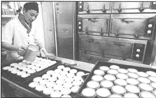
Traditional egg tarts

Recently the Hong Kong Government published a list of intangible cultural heritage items that the city should protect. The following were on the list: